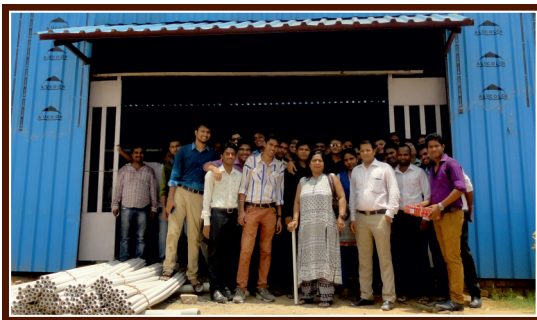
Industrial Visit to Atlas Pipes Ltd. - 25th May 2016