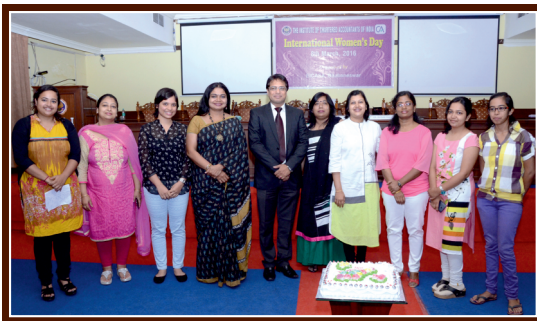
Women's Day Celebration - 8th March 2016