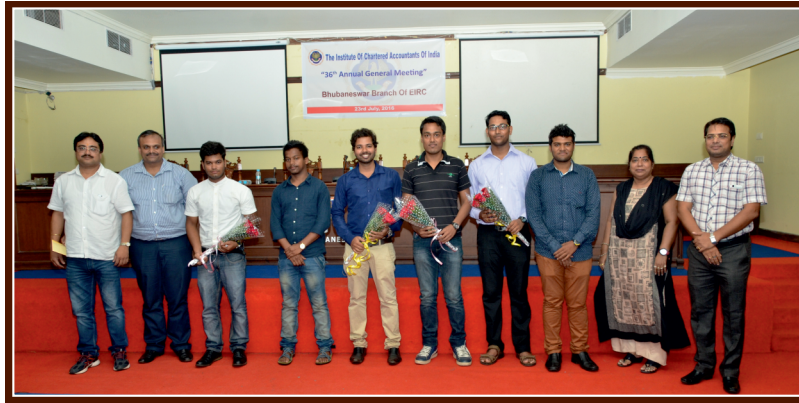
Moments of rejoice - Newly elected EICASA Team with Members of Managing Committee, Bhubaneswar Branch