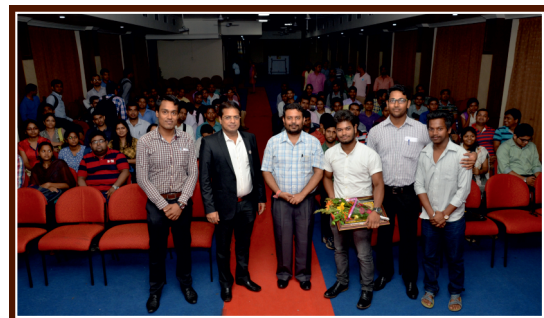
Seminar on GST - 25th August 2016