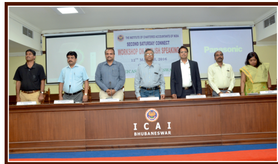
Workshop on English Speaking - 12th March 2016