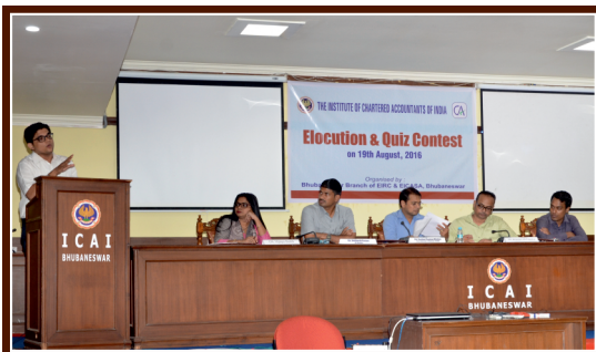
Elocution & Quiz Contest - 19th August 2016