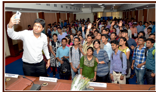
Seminar on Company Law - 25th June 2016